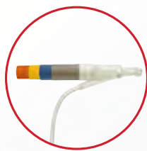
Proprietary 4 th Layer